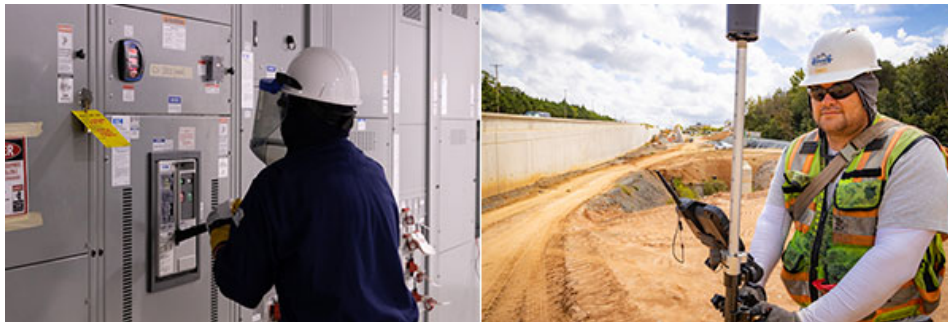
Left: A Purple Line worker prepares to flip a switch as workers establish permanent power at the Glenridge Operations and Maintenance Facility, which will be the hub of light rail operations. Right: A Purple Line worker is surveying at the Glenridge facility.