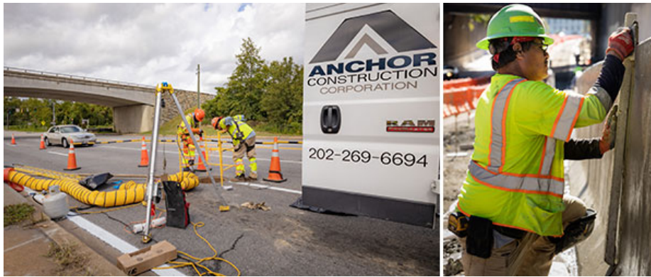
Left: A Purple Line worker from Anchor Construction helps with utility work near the Baltimore-Washington Parkway. Right: A Purple Line worker applies finishing touches to a retaining wall on Campus Drive in College Park.