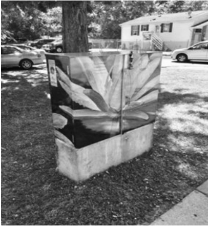
Daniel B. McNeill, White Water Lily 5300 block of Riverdale Road

If you are clearing more than 5,000 square feet of trees, you need a grading permit. Contact DPIE Site/Road Plan Review Division at 301-636-2060 for