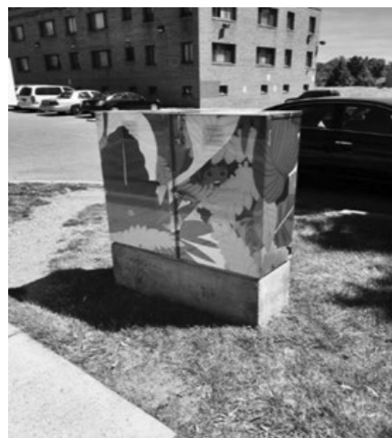
Anna Hayden-Roy, Nature Spirits 5000 block of Riverdale Road