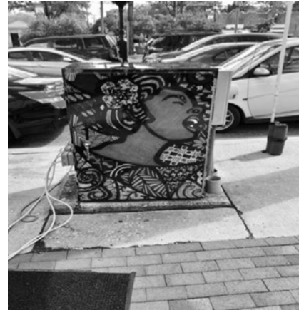
Andrea A Noel, Jazz 6200 block of Rhode Island Avenue

A total of (5) wraps have been installed at the following locations: