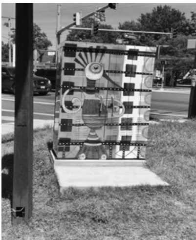
Elyse Harrison, Flying on the Sidewalk 5400 block of Kenilworth Avenue